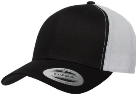
$30 TRUCKER HAT