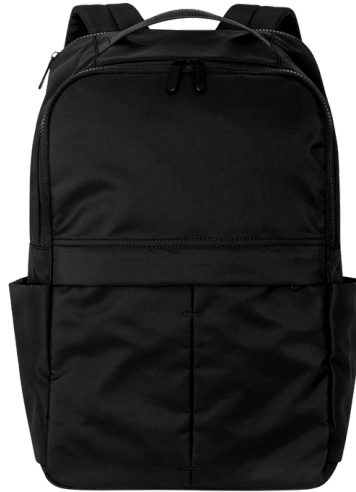
$50 BACK PACK