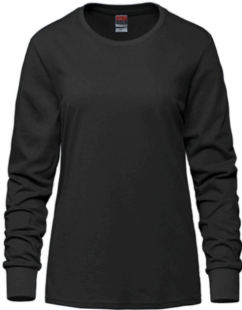
$45 LONG SLEEVES T-SHIRT