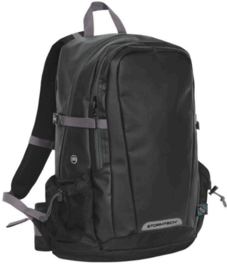
$120 BACK PACK