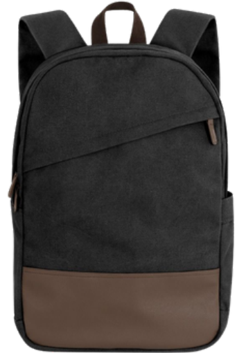
$65 CANVAS BACK PACK