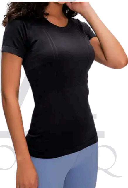
SHORT SLEEVES (60$)