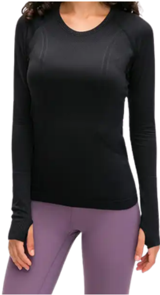
LONG SLEEVES (70$)