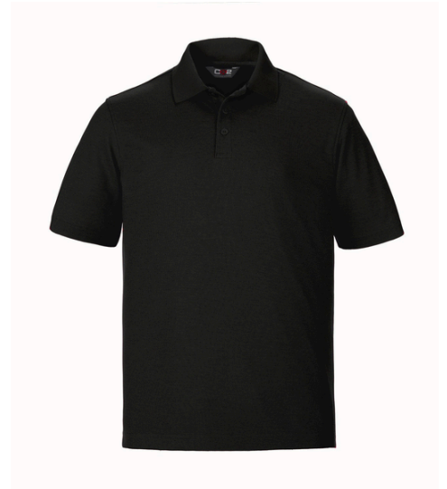
$60 POLO SHIRT