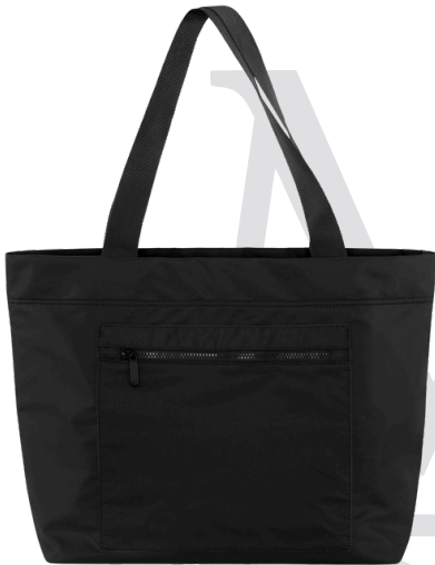
$50 ZIP TOTE BAG