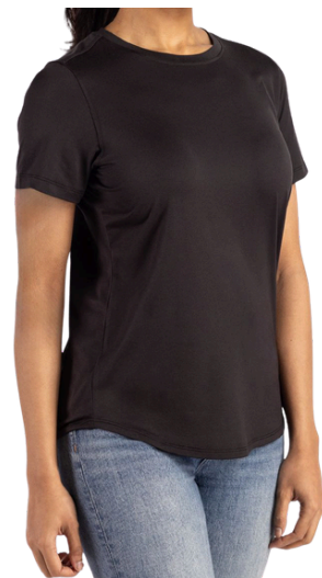
$45 COASTLINE T-SHIRT