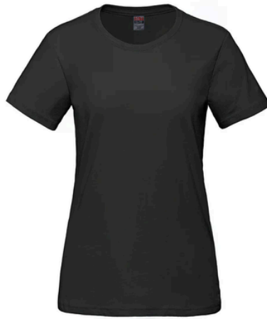
$35 SHORT SLEEVES T-SHIRT