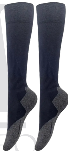
$20 MAJOREQ SOCKS