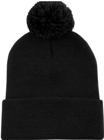
$30 POMPOM TOUQUE