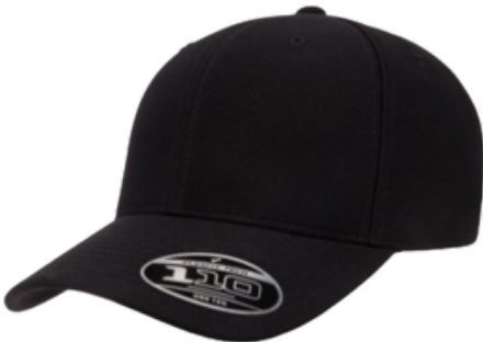
$30 FLEX CAP