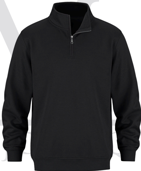
1/4 ZIP SWEATER