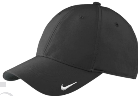
$55 NIKE LEGACY CAP