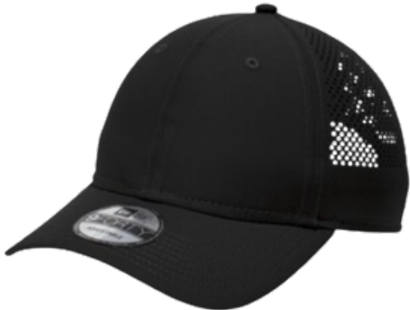
$45 PERFORATED CAP